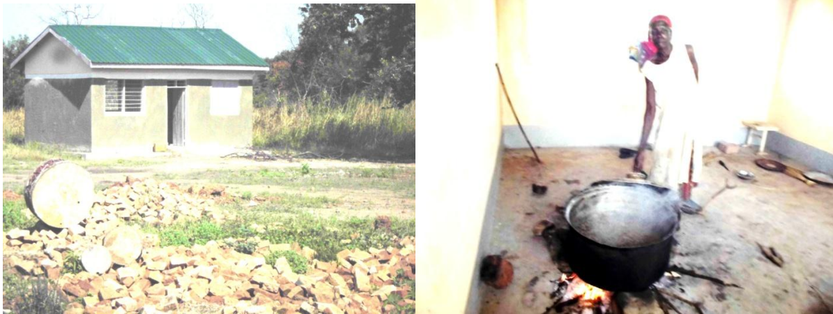
Figure 5: Kitchen/Storage and Cooking stove on the floor in Warahel Primary school.